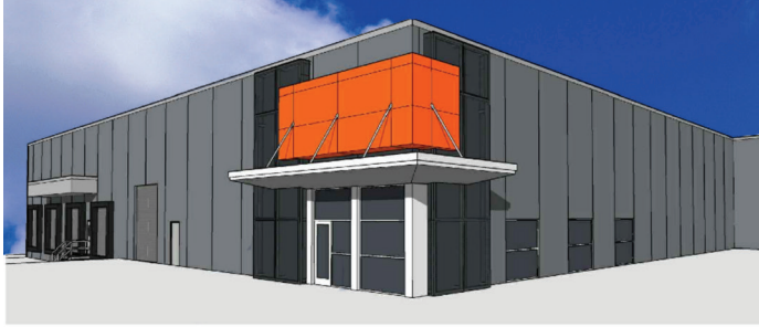
SOUTH WEST CORNER ENTRY