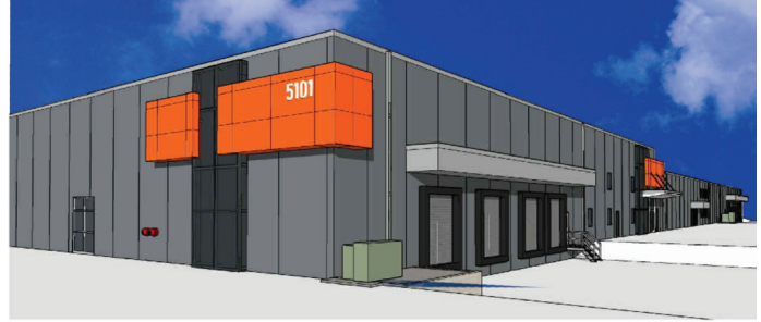
SOUTH WEST CORNER